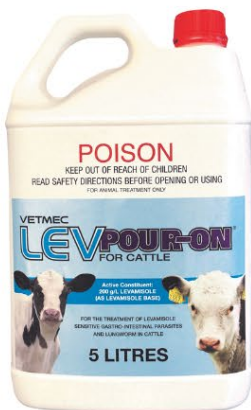
Vetmec LEV Pour-On