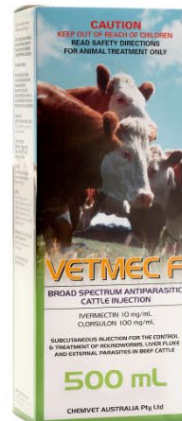
Vetmec F Injection