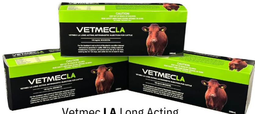
Vetmec LA Long Acting Injection