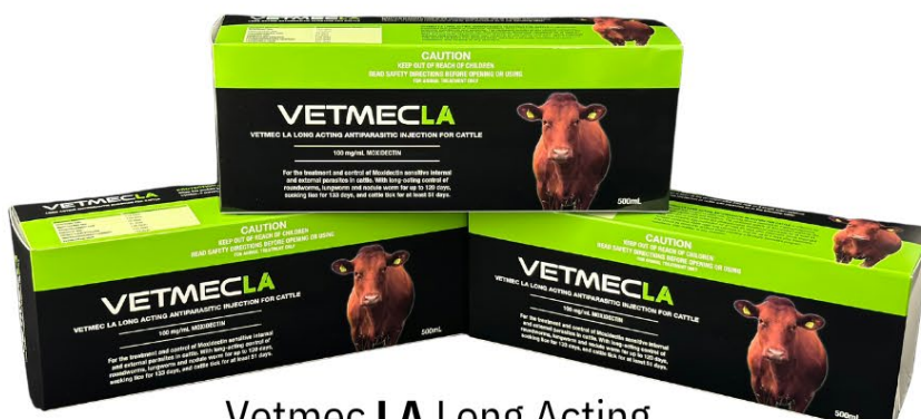
Vetmec LA Long Acting Injection