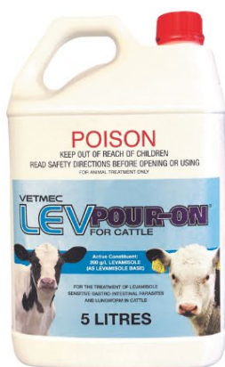
Vetmec LEV Pour-On