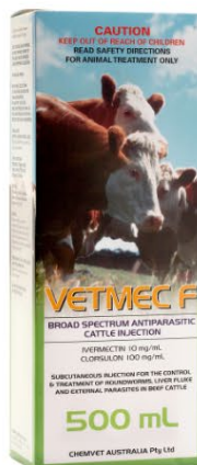
Vetmec F Injection